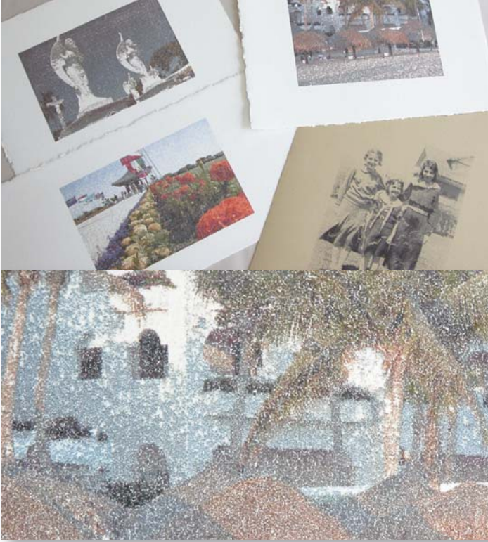
Top: An assortment of contact prints